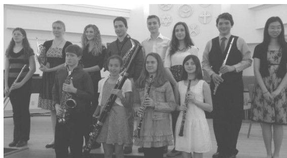
Above: Performers at the 2014 FPM Stellar Winds Recital Below: One group of performers at the 2014 FPM Musical Marathon

Details and more information about our activities can be found at: www.thefpm.org and on Facebook: Foundation for the Promotion of Music.