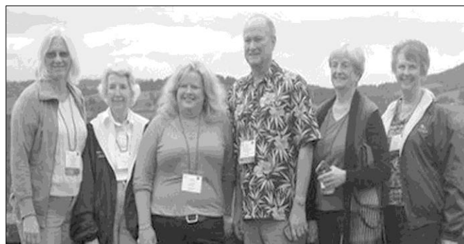
FFMC delegates enjoying their outing at the Columbia River Gorge